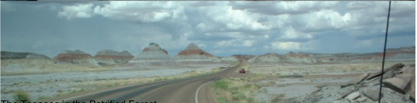
The Teepees in the Petrified Forest.