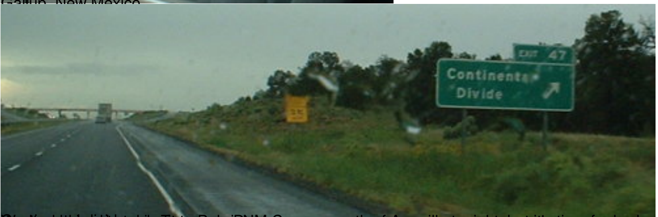
Continental Divide, near Tularosa, NM. Canyon south of Amarillo tonight, but it's time for bed so