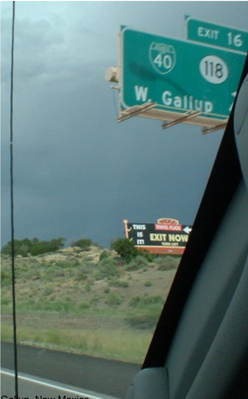
Gallup, New Mexico

Wednesday, 06 August 2008 01:50 - Last Updated Thursday, 14 August 2008 08:27