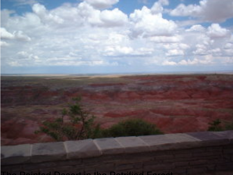
The Painted Desert in the Petrified Forest