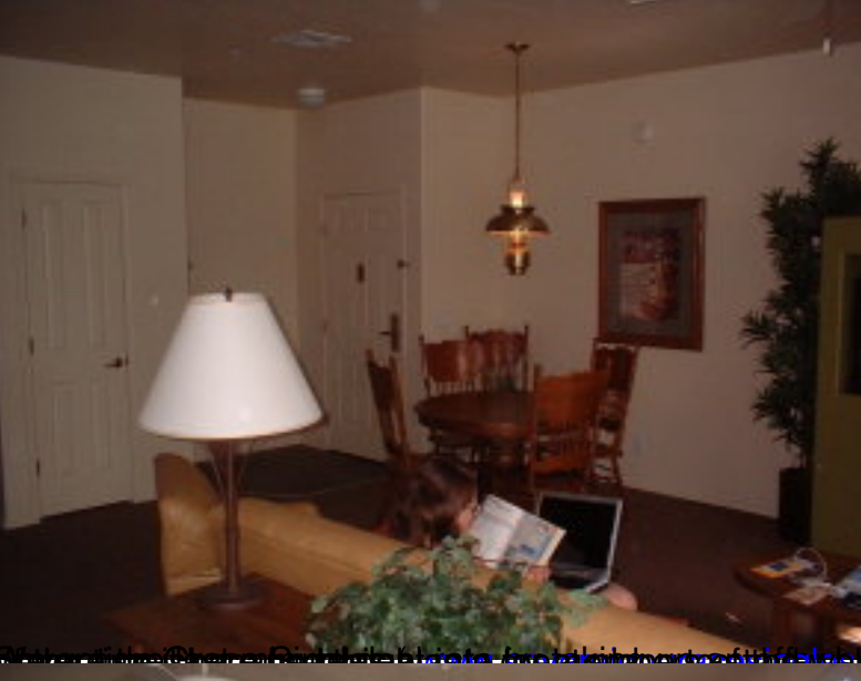
Siteato volsette ossited heissinentalea, tsib Tilseybart