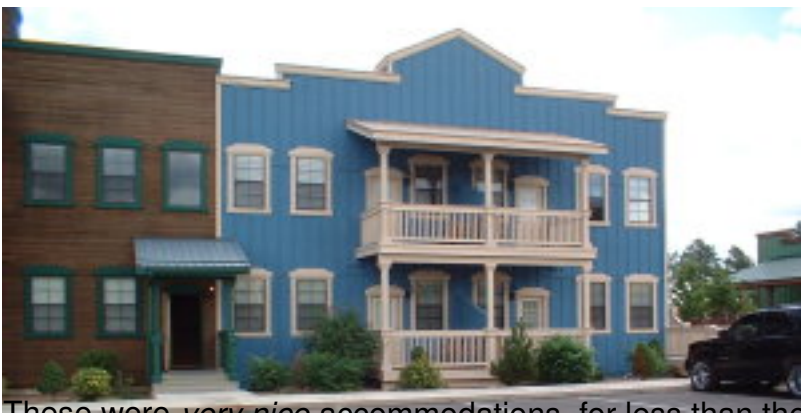
hase were very nice accommodations, for loss than the cost of a hotel.

Written by Tim Black Monday, 04 August 2008 06:20